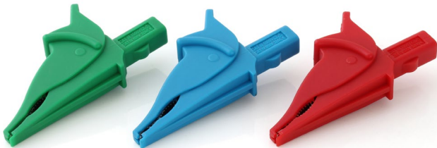
Alligator clips, Order No. ACC00008