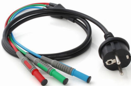
Schuko-plug test cable, Order No. ACC00007