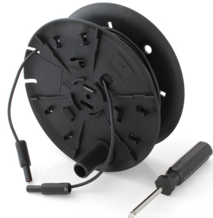
40m extension test lead, Order No. ACC00010