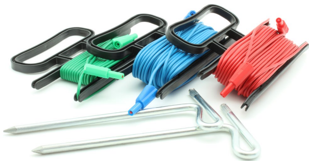
earth kit (3 x cables 20m/20m/5m + 2 x earth stakes), Order No. ACC00004