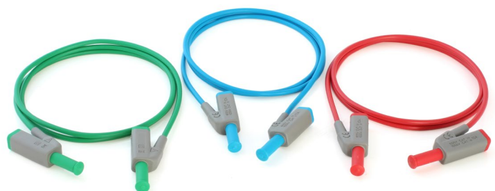
Test lead with plug-in option, 1m each, Order No. ACC00014