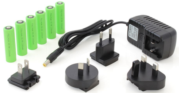
1 pc power adapter for charging & 6 pcs rechargeable batteries, Order No. ACC00009