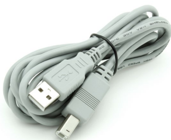
USB cable, Order No. ACC00013