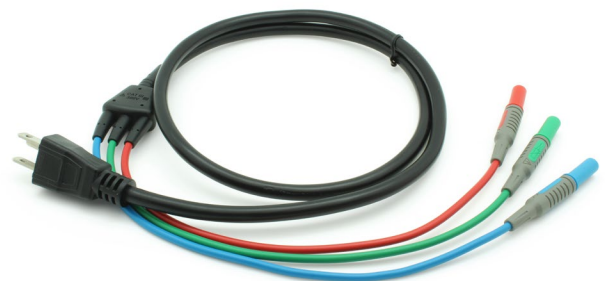
UK-plug test cable, Order No. ACC00006