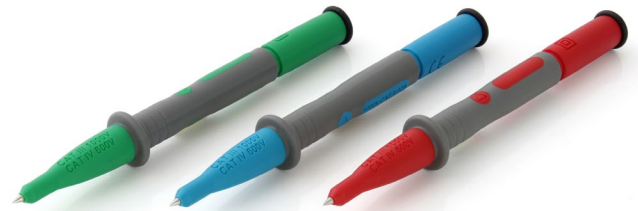
Test probes, Order No. ACC00016