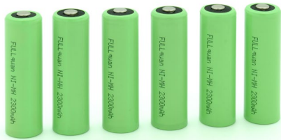
Rechargeable batteries (6 pcs.), Order No. ACC00019