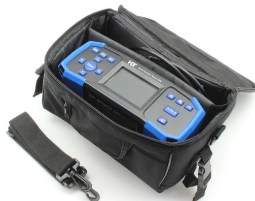
Professional bag with shoulder strap, Order No. ACC00012