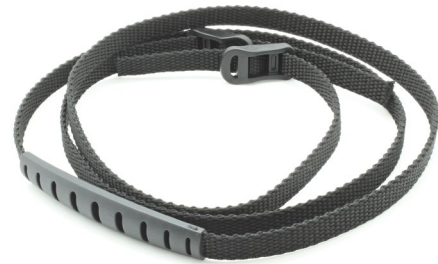
Shoulder strap for installation tester, Order No. MS050007