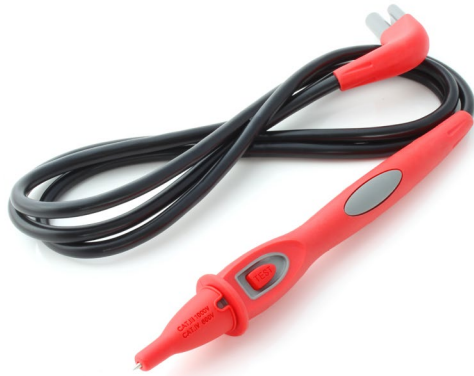
External probe with TEST button, Order No. ACC00003