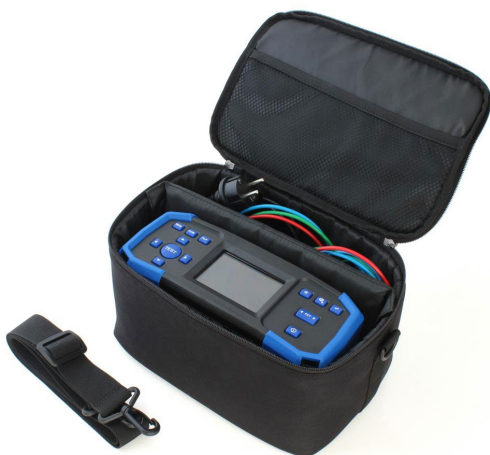
Carrying bag with shoulder strap, Order No. ACC00011