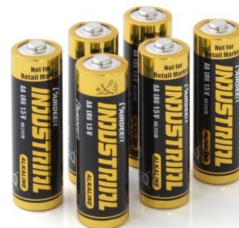
Batteries, 1,5V / AA, Order No. ACC00018